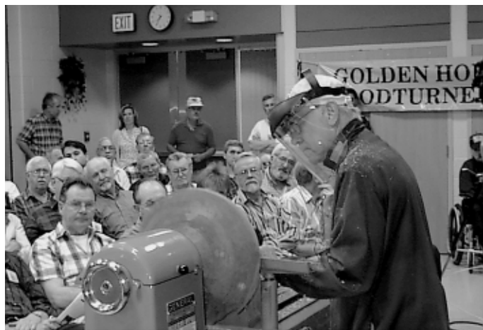
Really getting in deep