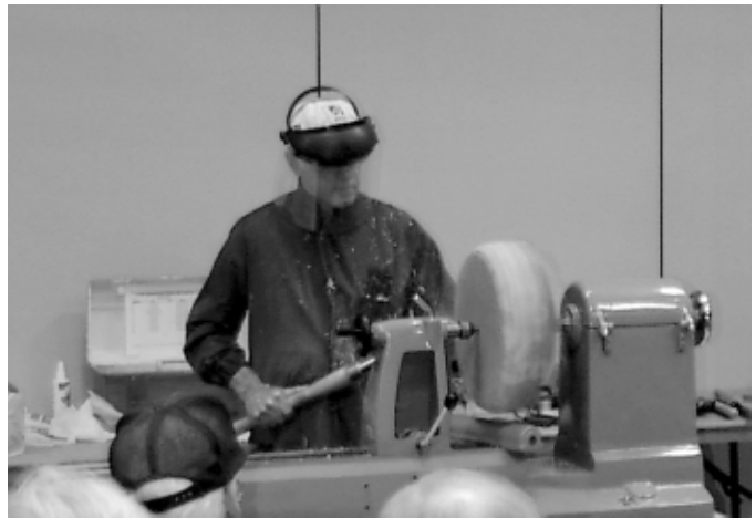
Power Turning technique